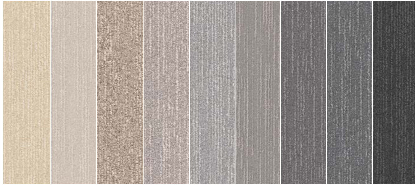
NORSE RAE 900PL NORSE SOREN 800PL NORSE LUND 700PL NORSE LARZ 600PL NORSE STEN 500PL NORSE ESKEL 400PL NORSE OSKAR 300PL NORSE JAX 200PL NORSE DYLAN 100PL