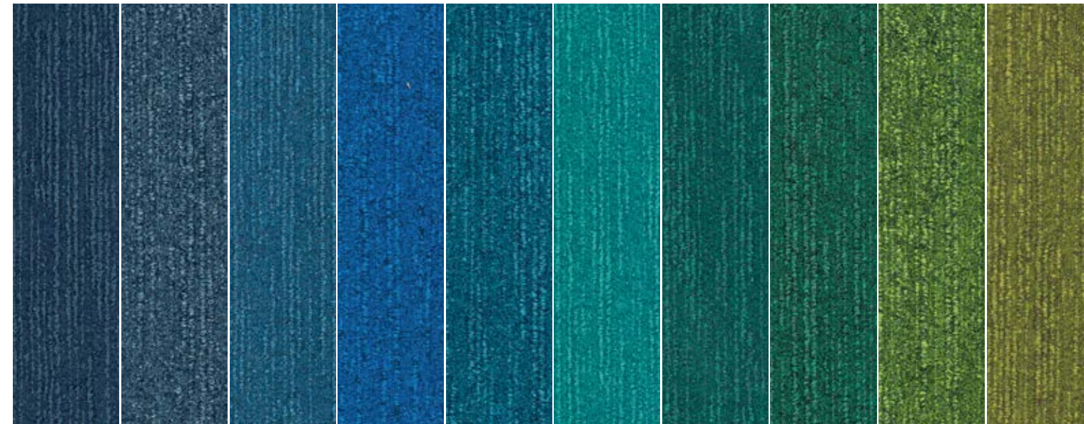
NORSE ROLF 067PL NORSE JAKOB 108PL NORSE BERGEN 105PL NORSE AAREN 004PL NORSE OLAF 071PL NORSE HENRIK 104PL NORSE TAIT 102PL NORSE HALDEN 103PL NORSE LEIF 045PL NORSE NILSEN 002PL